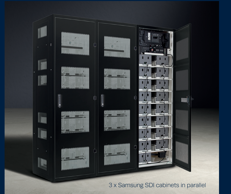
3 x Samsung SDI cabinets in parallel

Approved for use with Rehlko UPS systems and selected for their reliability, performance, safety and cost-effectiveness, Rehlko offers lithium-ion UPS battery solutions from leading manufacturers Samsung SDI and Vision Group.